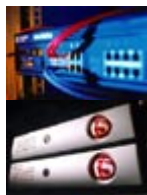
Load balancing services with F5 or Foundry.

siteBalance optimizes server performance against high network traffic and server loads by ensuring high availability and failover protection, and in detecting failure and redistributing access requests over multiple network points.